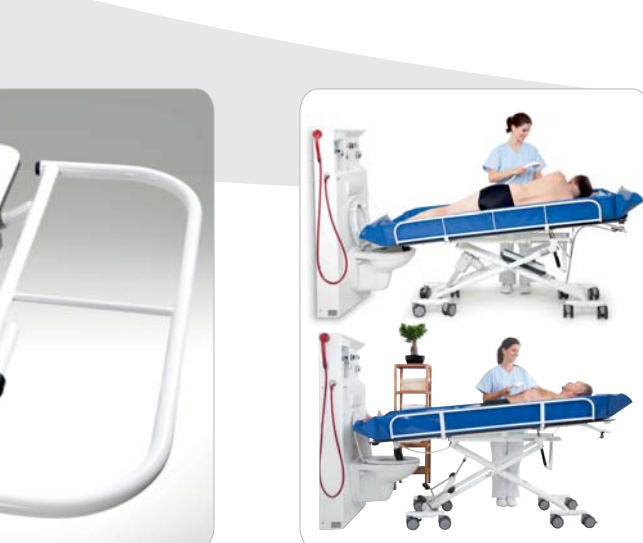
Adjustable rail with safety joints for extension of the shower surface.