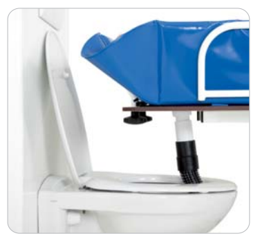
Flexible water drainage hose.