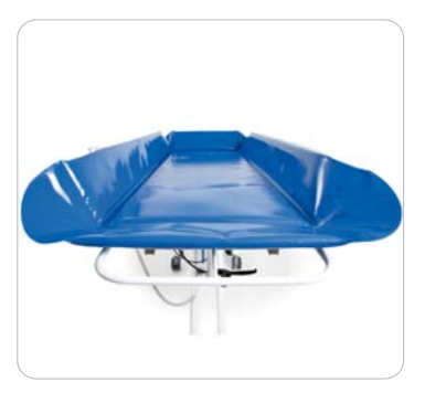
Padded, comfortable shower mattress.