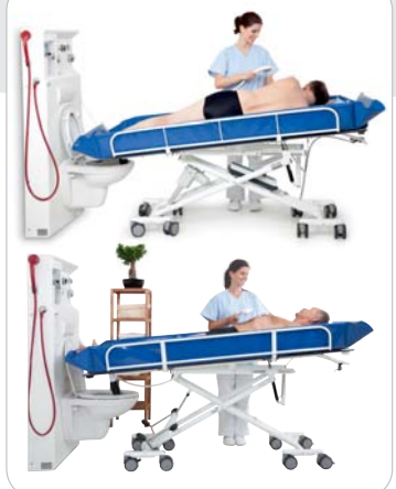
Optional: electric or hydraulic height adjustment.