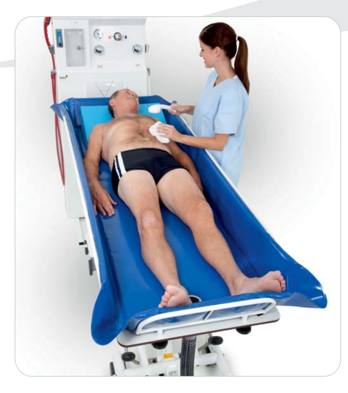
Can be used either with an extended shower hose from the shower or with a shower console to provide a full personal wash.